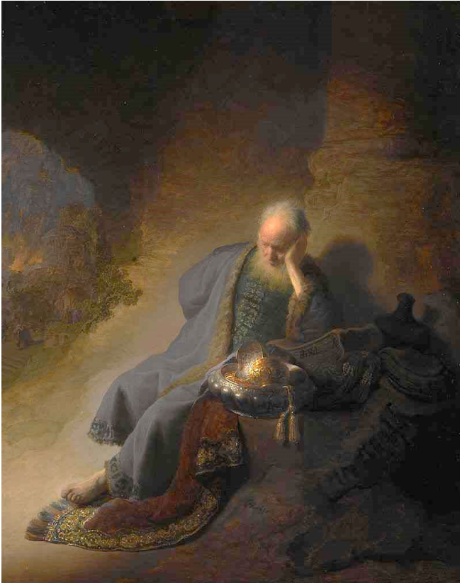
Jeremiah Lamenting the Destruction of Jerusalem - Rembrandt